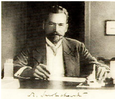
Marian Smoluchowski (1872-1917)

Marian Smoluchowski, an outstanding Polish theoretical physicist, great intellectual personality, and Tatra mountaineer performed many of his scientific works here.